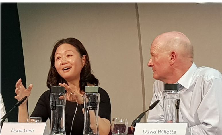
Panellist Linda Yueh at the 2022 Stagnation nation conference event, with Lord Willetts

The UK is on the brink of a decisive decade of huge economic change, on a scale not seen in a generation. As well as restructuring after Covid-19, we are also exiting the EU, urgently transitioning towards a Net Zero future, and adapting to fundamental technological shifts amidst an ageing population.