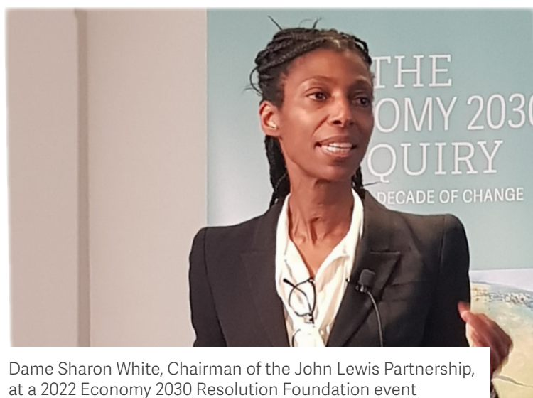
Dame Sharon White, Chairman of the John Lewis Partnership, at a 2022 Economy 2030 Resolution Foundation event

your application. Each of your answers will be reviewed separately and anonymously by different people.