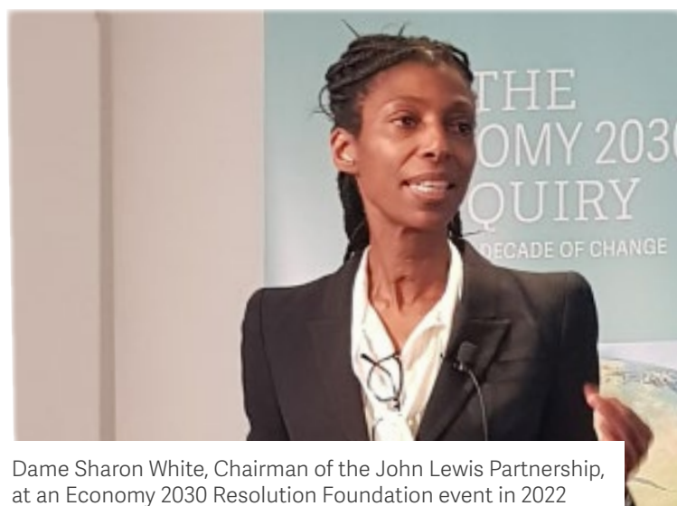
Dame Sharon White, Chairman of the John Lewis Partnership, at an Economy 2030 Resolution Foundation event in 2022

your application. Each of your answers will be reviewed separately and anonymously by different people.